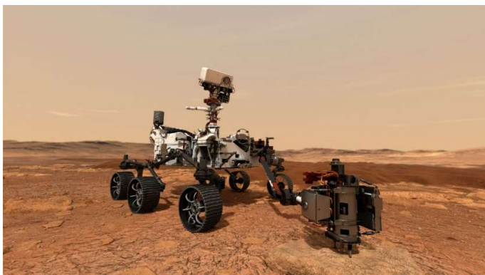
The Perseverance rover obtaining a sample on Mars (artist's rendition)

The press release is available on the internet at: www.maxongroup.net.au