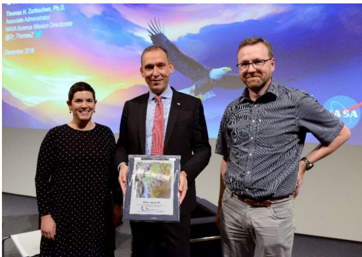
Thomas Zurbuchen (center), research director at NASA, presents members of the maxon SpaceLab with a plaque of appreciation for their contributions to the Mars2020 mission.