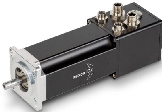
IDX compact drive with integrated EPOS positioning controllers and IP-protected housing.