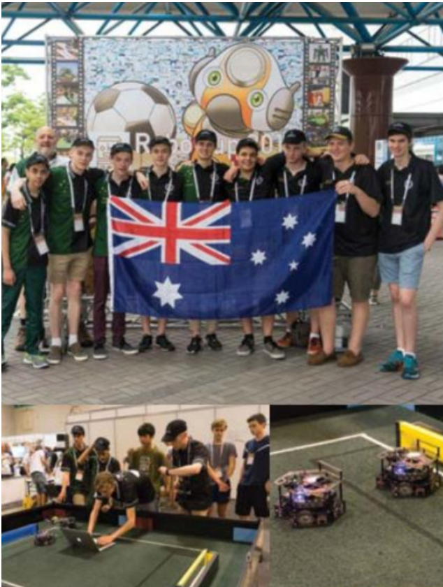
The BBC winning team at RoboCup 2017

maxon motor Australia Pty Ltd Unit 1, 12-14 Beaumont Road Mt Kuring-Gai NSW 2080 Tel: +61 2 9457 7477 Fax: +61 2 9457 8366 info.au@maxonmotor.com www.maxonmotor.com.au Twitter @maxonmotoraust